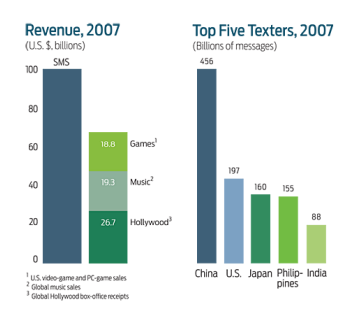
Figure 2: 2007 Texting Numbers

[4], as part of the existing ByStar Business Plan [5]. This is an Open Business Plan that specifically addresses the dynamics and mechanisms of business operation within the non-proprietary , for-profit quadrant .